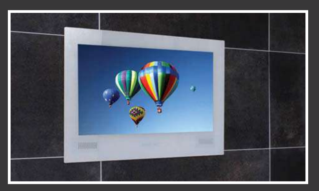
White (19inch + 24inch only)